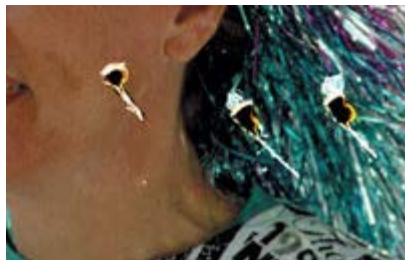
Positive scanned image of damaged color negative.

A Histogram is a visual display of all the digital data contained in an image from black to white. At the bottom of the Histogram you will find three sliding triangles that control the shadows (left s), midtones (centers), and the highlights (right s). These sliders can be moved to adjust the gamma.