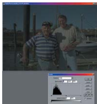
Under-processed film with histogram showing how data falls on standard photographic curve.

Occasionally wet film will get stuck together, and when separated part of the film's emulsion is removed. Ouch! This is one of the more difficult problems to repair, and will require someone with extensive expertise in digital color channels, histograms, curve editing, and use of the clone tool. Images damaged with chemical stains can also be treated using this same repair procedure.